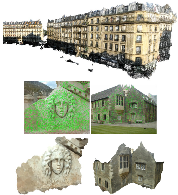
Figure 4: Some of our single-view (bottom) and 428-image large-scale (top) results. All visualizations are lightweight textureless renderings with per-face mean coloring.

good quality visualizations with a lightweight textureless rendering by per-face flat coloring (no need for complicated texture atlases).