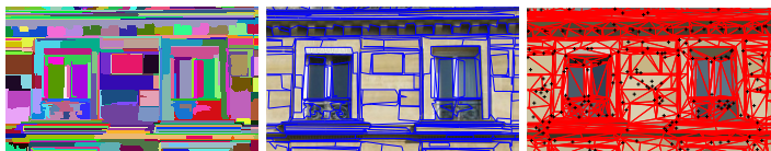
Figure 3: One way of obtaining a 2D base mesh: superpixelization (left), boundary polygonization (middle), constrained Delaunay-triangulation (right).

Unlike these works, our method (see Fig. 2) operates over a triangular mesh rather than pixels, derives a 2D base mesh aligned to gradients in the image (Fig. 3), and then lifts this mesh to 3D by performing an efficient depth optimization at the vertices using the sparse GCPs as soft constraints.